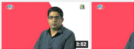
Sexual Disfunction in women ▶ Orgasm in women - Misconceptions ▶